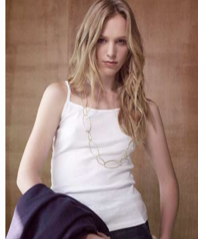
1011 BABY RIB SPAGHETTI STRAP TANK TOP A classic Bella fit tank top with self binding on straps and around the armhole. 100% cotton 30 single combed ring-spun 195 gm/m2 super soft 1 x 1 baby rib knit. S, M, L, XL